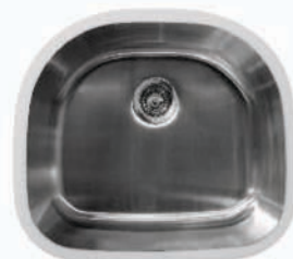
Model: E-130 Outside dimensions: 23-3/4" x 21-1/4" Inside dimensions: 21-1/4" x 18-3/4" x 8-1/2"