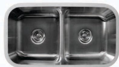
Model: E-150 Outside dimensions: 33" x 18-1/2" Inside dimensions: Each bowl: 14-1/4" x 16" x 7-3/4"

Crafted from high quality T-304, 18/10 stainless steel, all Edge sinks are constructed from heavy 18 gauge stainless steel with a brushed satin finish for long lasting beauty and durability. Initial designs include a double bowl, two single bowls and a bar sink, with more designs to follow.