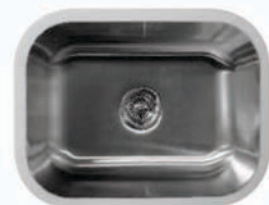
Model: E-120 Outside dimensions: 23-1/2" x 18-1/4" Inside dimensions: 21" x 15-3/4" x 8-1/2"