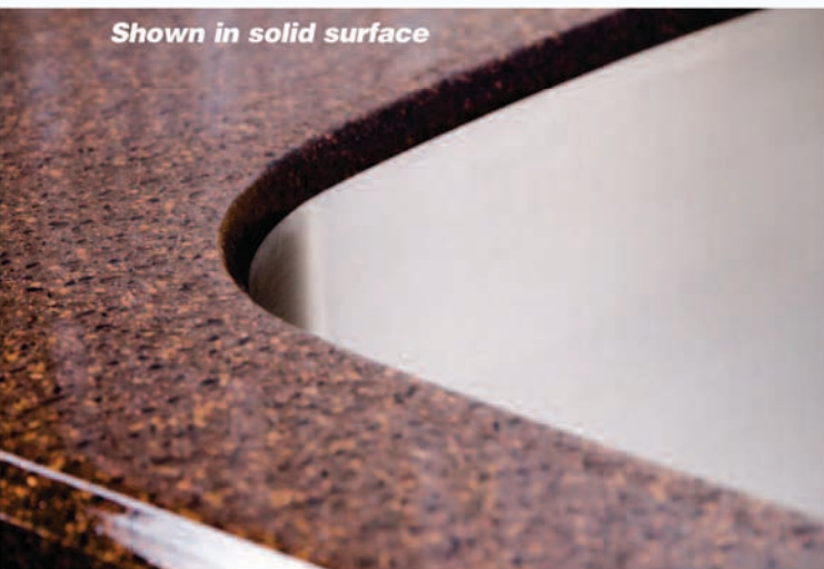
Shown in solid surface