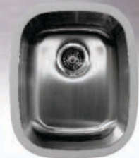
Model: E-110 Outside dimensions: 15-1/2" x 19" Inside dimensions: 13" x 16-1/2" x 6-1/2"